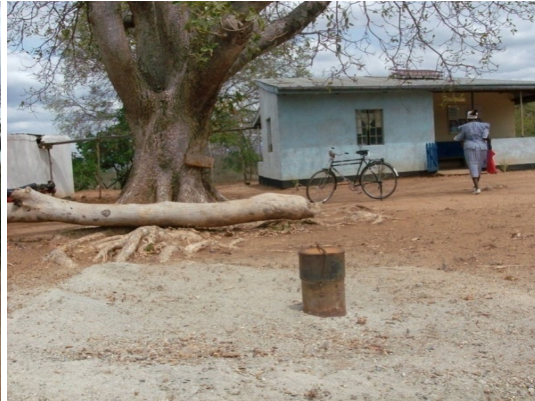
The 2007 borehole in the precincts of Kanziku dispensary that will never be ( Stump of corked piping)

This case opens up the theme of this study and provides a background to the dilemmas surrounding integration of local knowledge in community development projects.