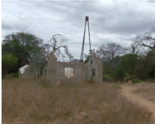
Remains of the 1960s borehole