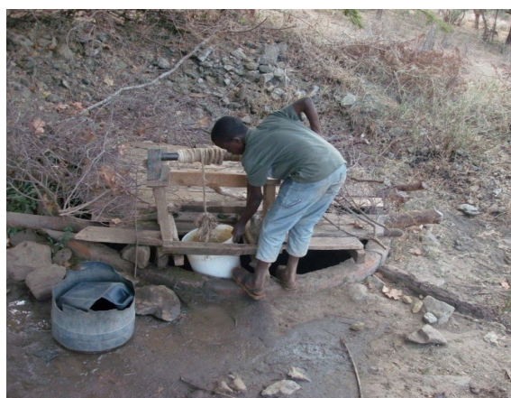
Yielding community member well on the right bank directly opposite the NGO aided borehole

The above report is contradictory in that NGO officers report