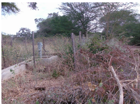
Non-yielding shallow borehole on the left bank aided by an NGO

According to the community, NGO experts do not listen to them most of the time. The community cited ‘dictation’ in choosing of sites by engineers as one example. A key informant said “engineers come, we walk the area with them, they take measurements along the way, and they identify the sites, without us understanding what is going on”. The same informant took me to a site along the river Mamole where on the left bank he owns a productive well and one NGO came to drill a community borehole on the right bank which never yielded water. From years of practice, perfected by trial and error, the community knew that water is available only in the left bank but even when they informed the NGO engineers this, the engineers went ahead with their water measurement techniques and identified the right bank site. The borehole never hit any water. Today it stands as a white elephant (see the pictures below).