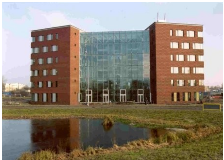
Het waterschapshuis is gevestigd aan het Aquapark

Algemeen telefoonnummer tel. (0598) 693 800 Algemeen faxnummer fax (0598) 693 893 Meldingen en calamiteiten (24 uur per dag) tel. 0900 - 33 66 990 (€ 0,10 per min.) Belastinglijn tel. 0800 - 3681000 (gratis)